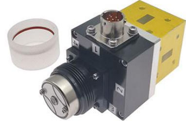
Generic photo used for illustration only

*Adding an additional waveguide load for SPDT option.