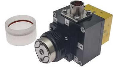
Generic photo used for illustration only

*Adding an additional waveguide load for SPDT option.