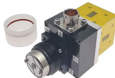
Generic photo used for illustration only

*Adding an additional waveguide load for SPDT option.